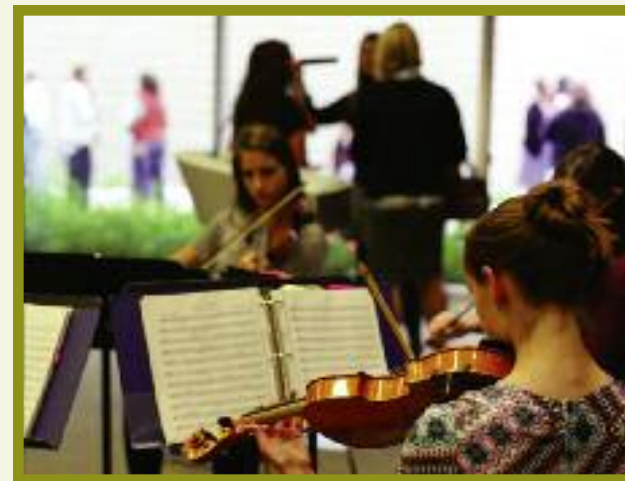
MNA 2015 Annual Conference

MNA'S BUSINESS MODEL is currently 75% earned income and 25% contributed. In 2015, MNA's work in Montana communities reached further and deeper than ever before because of support from the First Interstate Bank Foundation, High Stakes Foundation, Montana Community Foundation, Mountain Sky Guest Ranch Fund/Arthur M. Blank Family Foundation, M.J. Murdock Charitable Trust, O.P. & W.E. Edwards Foundation, Oro y Plata Foundation, Paul G. Allen Foundation, Salesforce Foundation, Steele Reese Foundation, Treacy Foundation, and the Dennis and Phyllis Washington Foundation.