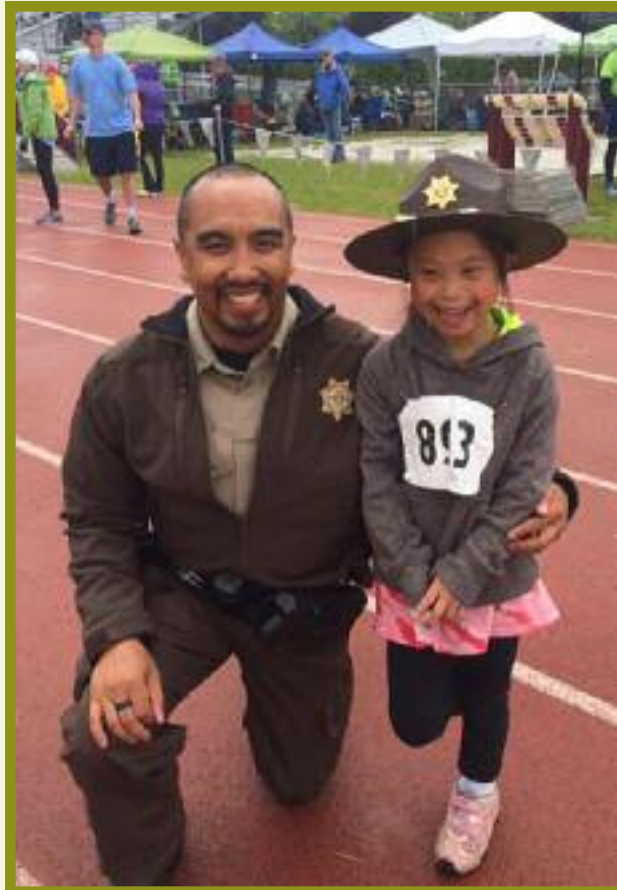
Special Olympics Law Enforcement Torch Run, Ravalli County.