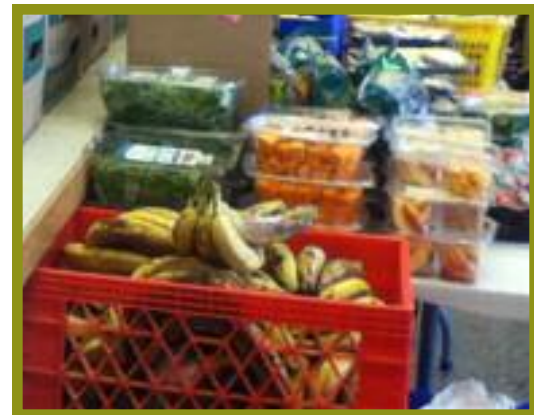
Right: North Valley Food Bank