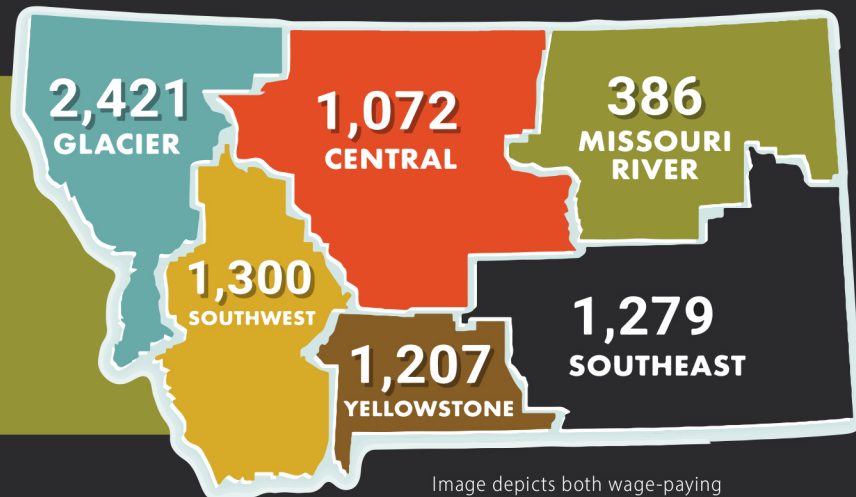
Image depicts both wage-paying and all-volunteer run nonprofits

38% of charitable nonprofits operate in rural areas and make up 30% of nonprofit employment.